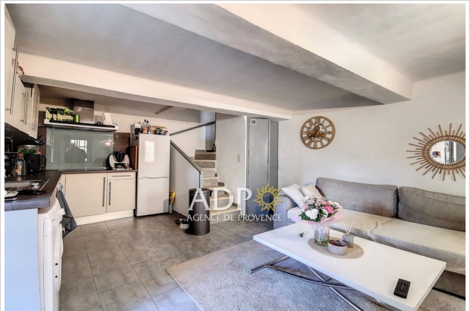
Duplex 2651 Peymeinade